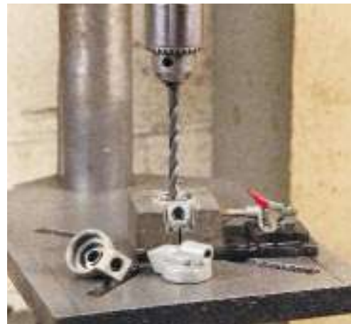
Plastic Steel Liquid offers a fast and economical way of making holding fixtures