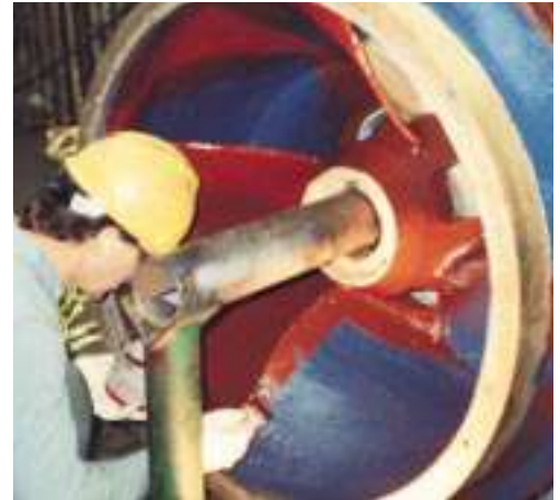
Ceramic Repair Putty protects equipment surfaces from damage due to wear and abrasion, extending service life and often eliminating the cost of replacement.

Sprayable Ceramic is a ceramic-reinforced composite that can be sprayed in a manner similar to high-solids paints. It is ideal for protecting pumps, pump pads, paper machines, stacks, steel frames and tanks. Sprayable Ceramic exhibits excellent chemical resistance and is available in a red or blue colour. Sprayable Ceramic uses standard airless equipment and is capable of being sprayed on in a thickness of between 400 and up to 600µm in one pass.