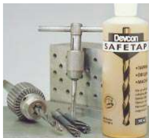
Safetap liquid - helping you work with metals and plastics safely.