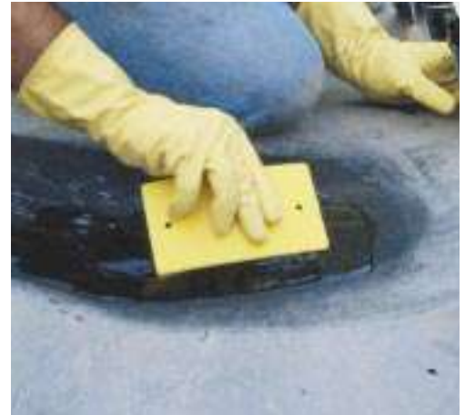
Use Flexane Putty to repair conveyor belts and rolls. It can also be trowelled on equipment surfaces to dampen sound and reduce vibration.

DEVCON Flexane Urethane Compounds are the toughest, most durable group of room temperature curing urethanes available to industry. These two component systems are available in putty and liquid form with a choice of engineered performance characteristics for protecting equipment against abrasion, impact and noise control and for casting custom rubber parts and low cost moulds. Flexane Liquid urethanes are widely used to make cost effective, non damaging holding fixtures, ultrasonic welding nests, punch dies and in combination with putties repairs with a smooth, waterproof sealing coat. (For further technical information refer to Technical Data section.)