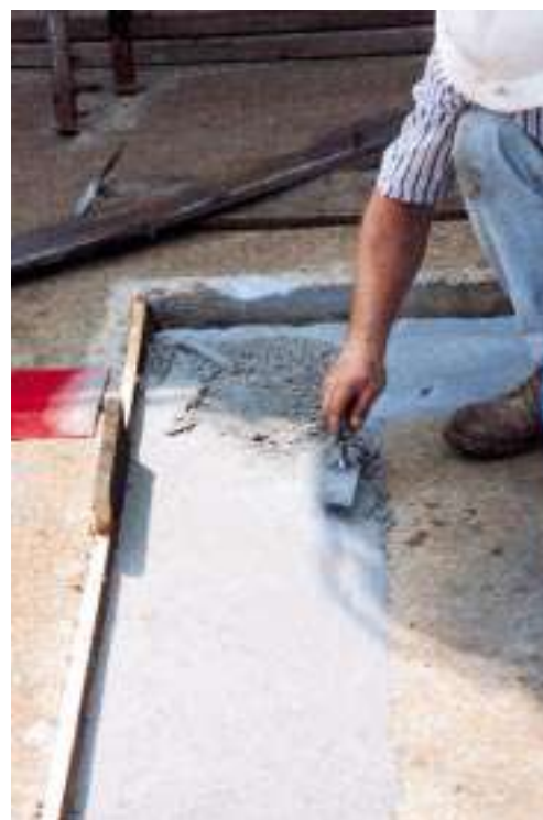
Floor Patch is also ideal for doing larger repairs.