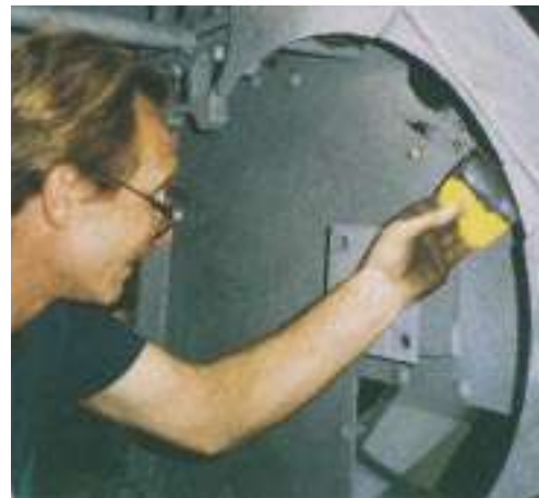
Plastic Steel, the first metal fortified epoxy repair compound is still one of the most effective for a wide range of general metal repair and rebuilding applications.

Aluminium filled, high strength bonding, patching and sealing paste that bonds to Aluminium and other metals, ceramics, wood, concrete or glass. Fasmetal 10 is ideally suited for air conditioning repairs.