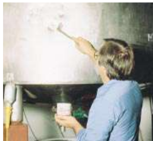
Stainless Steel Putty is ideal for making non-rusting repairs to stainless steel food processing equipment.