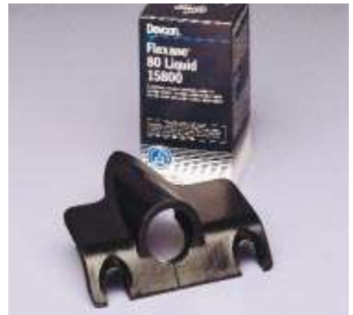
Use Flexane Liquids to mould small, quantities of rubber parts easily and economically.

Liquid version of Flexane 80 Putty. Castable, non shrinking, urethane compound for making rugged, flexible moulds, forming dies, cast parts, non scratching holding fixtures and abrasion-noise resistant linings. Flexane 80 Liquid makes precision moulds that faithfully reproduce detail, will not change shape while curing, returns to original shape after 350% elongation and has a 10 hour demoulding time. Flexane primers are recommended for maximum adhesion to metal, wood and concrete surfaces.