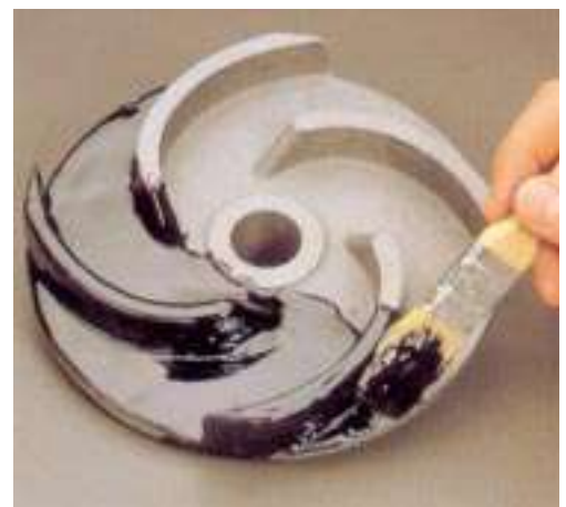
Flexane Brushable is an easily applicable finish that will protect your equipment from wear and corrosion

High performance, brushable urethane coating that cures to a medium hard rubber, Shore A 86 hardness, for protection against wear due to abrasion and impact. Having outstanding tensile strength and very good chemical resistance, this product is excellent for lining and protecting hoppers, chutes, pump impellers, feeder bowls and fans. Flexane primers are recommended for maximum adhesion to metal, wood and concrete surfaces.