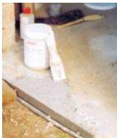
Floor Patch is easily applied and can be coloured to match the surrounding surface.