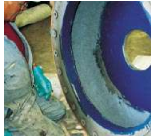
Wear Guard High Load offers an economical way to protect equipment surfaces from abrasion damage caused by particulate greater than 3mm.