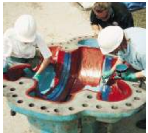
Brushable Ceramic provides pumps and other equipment with a smooth protective barrier against wear, abrasion, corrosion, erosion and chemical, attack, and it fills holes and voids in castings.