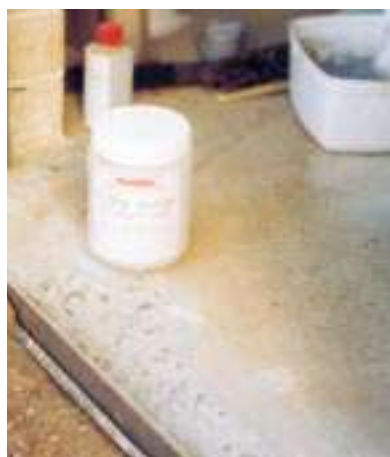
Remove all loose material and provide shoring to shape the repair by Floor Patch

This extremely versatile and high performance product has approximately three times the compression strength of concrete. It can be used to resurface old or new concrete, sealing masonry walls, excellent for filling old anchor bolt holes or anchoring machinery in concrete or masonry as it is non shrinking and non sagging. Floor Patch has good impact strength and resistance to oils, petrol, water, alkalis and acids. Sets quickly and cures overnight.