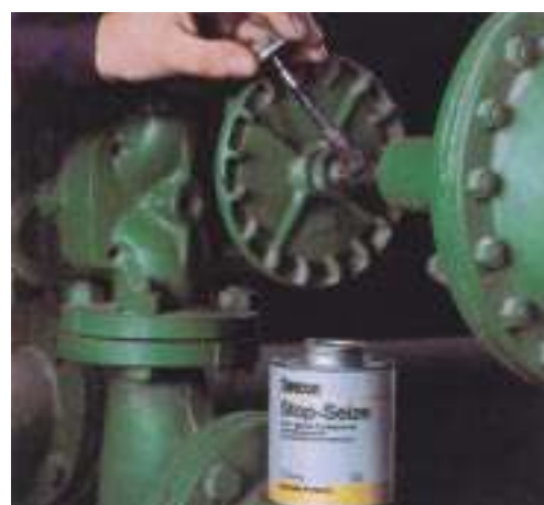
Threaded fittings are protected against sealing and locking with Stop Seize high temperature lubricant.