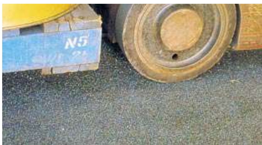
Devcon's Floor Grip Anti Skid provides a durable, non-slip surface on steel, wood or concrete, and is impervious to most liquid spills.

This durable epoxy can be used on steel, wood or concrete and produces a long lasting anti-skid surface for floors, ramps, stairs, catwalks, loading docks or anywhere a safety hazard exists. Floor Grip is easily applied by brush or roller and carbide granules are sprinkled over to provide a superb non slip finish. It is impervious to water, weather, oils, petrol and most chemicals and cures as low as 4°C.