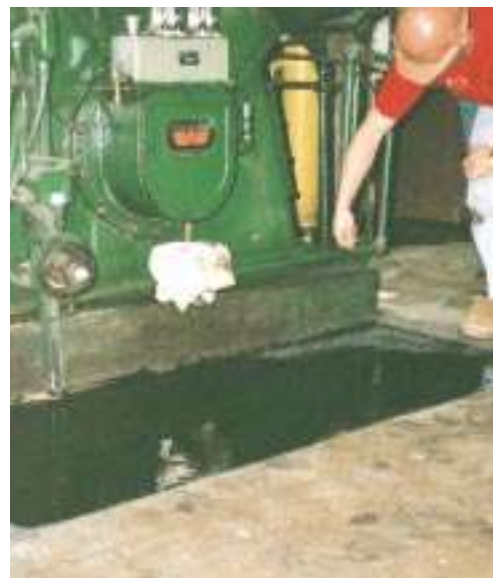
Devcon's Floor Patch provides a durable anti-skid surface for a safer environment in the vicinity of machinery and other equipment that tends to leak oil or other fluids.